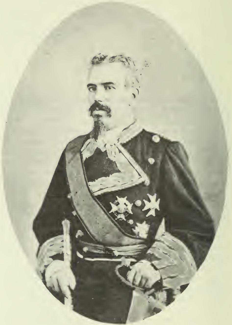
FIGURE P.1 • Arsenio Martínez Campos, ca. 1870.